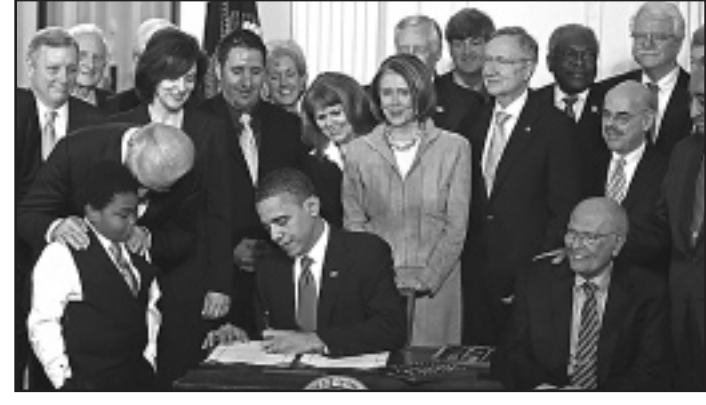
PRESIDENT OBAMA SIGNING THE HEALTH CARE REFORM BILL. PHOTO

riety of health care plans for individuals and small businesses that don't get coverage from their employ-At the ers. same time, government subsidies will available to those earning up to 400%